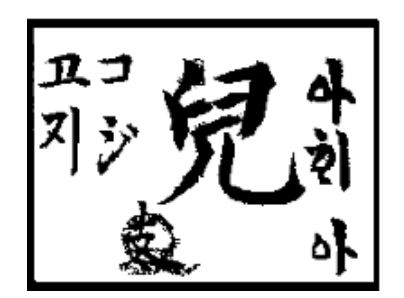
Figure 1. 1908 Ahak Pyeon